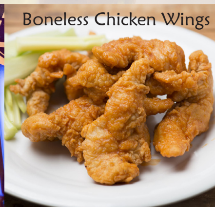
Boneless Chicken Wings