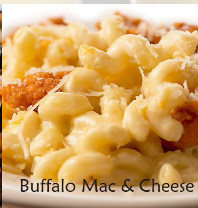
Buffalo Mac & Cheese